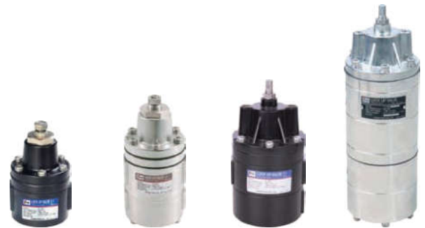
YT-400S YT-405D YT-430S YT-435D